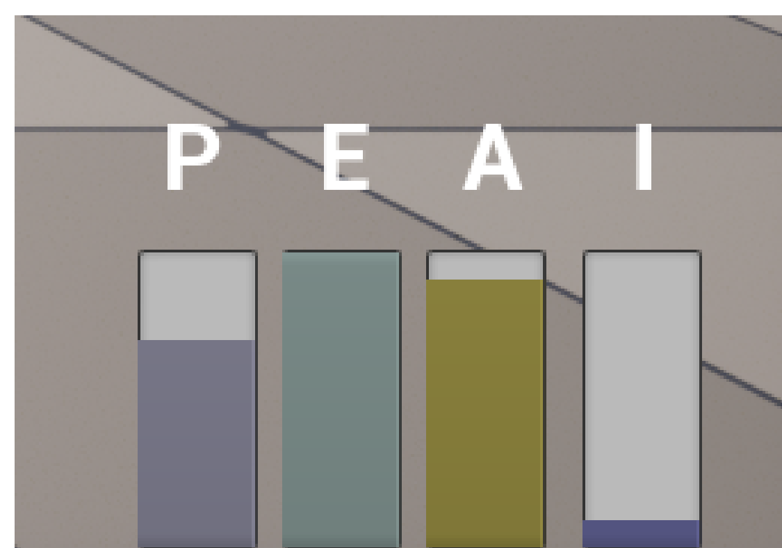
Fig. 1: Screenshot of the randomised resources.

The computing artefact developed to test is a combat artificial intelligence attached to an enemy non-player character for a small turn-based strategy game with a focus on resource management and combo building. In this game, you have a limited set of randomised resources that can be used to build combos to attack an opponent. Combos vary in resource costs and which resource is required for it to be cast you may also use more or fewer resources at random when casting a combo creating an uncertain and dynamic environment that the artificial intelligence must overcome. Additionally, the player is able to steal 1 unit of the most abundant resource the opponent has but is only able to do this once. To win you must defeat the opponent by reducing their health to 0. The combat artificial intelligence must be able to find the optimal set of combos with the current resources that it has on hand and perform those actions to defeat its opponent whilst keeping itself alive.