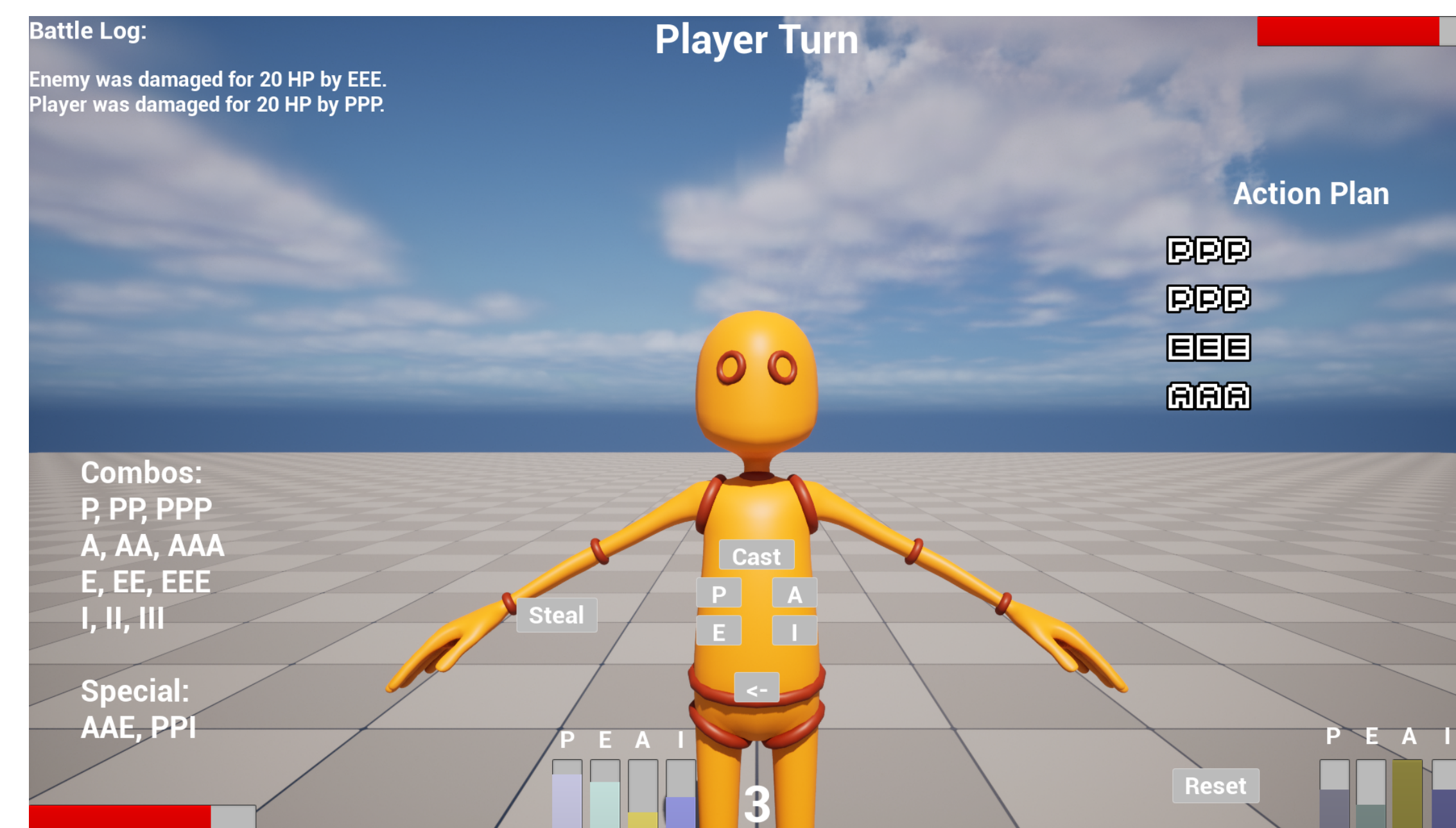
Fig. 2: Screenshot of the artefact.

The implementation of the Goal-Oriented Action Planning algorithm is based on the implementation by Whyte (Whyte 2019) in the game engine Unity with some modifications, additions and optimisations to suit the needs of the game engine Unreal, in which the artefact was developed in, and constraints when building the tree of possible actions to reach the agent's goal. The Goal-Oriented Action Planning algorithm and agent are implemented as an actor component that can be attached to any actor, pawn or character game object that requires the ability to make decisions when in turn-based combat, providing developers with the flexibility to apply the artificial intelligence using Goal-Oriented Action Planning anywhere as needed. The Goal-Oriented Action Planning algorithm also implements self-recovery re-planning if the first action plan will fail to reach the goal if the environment state does not match the predicted environment state the action plan has accounted for.